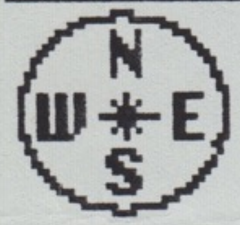
map of the mines